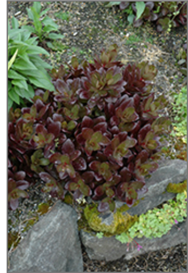
Chocolate Drop Stonecrop

This is a relatively low maintenance plant, and is best cleaned up in early spring before it resumes active growth for the season. It is a good choice for attracting butterflies to your yard, but is not particularly attractive to deer who tend to leave it alone in favor of tastier treats. It has no significant negative characteristics.