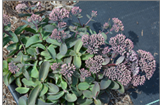
Chocolate Drop Stonecrop flower buds

Chocolate Drop Stonecrop is a fine choice for the garden, but it is also a good selection for planting in outdoor pots and containers. It is often used as a 'filler' in the 'spiller-thriller-filler' container combination, providing a mass of flowers and foliage against which the larger thriller plants stand out. Note that when growing plants in outdoor containers and baskets, they may require more frequent waterings than they would in the yard or garden.