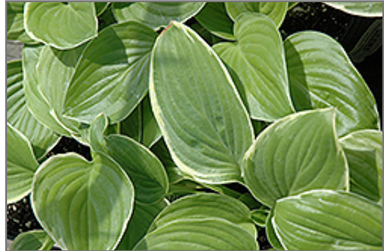
Frozen Margarita Hosta foliage