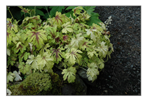
Golden Zebra Foamy Bells