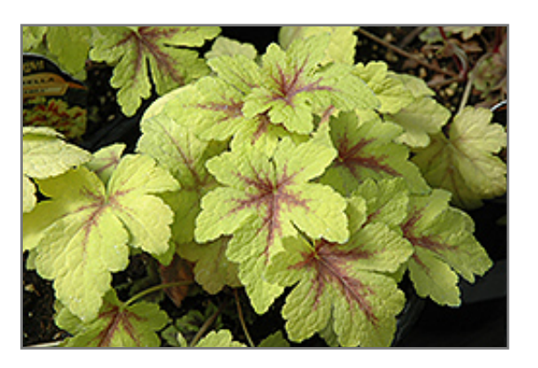
Golden Zebra Foamy Bells foliage