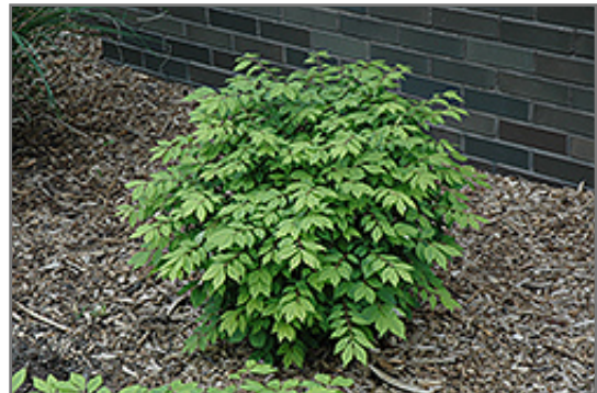
Little Moses Burning Bush