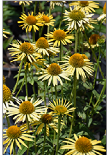
Maui Sunshine Coneflower flowers