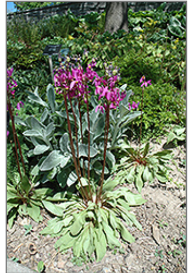
Aphrodite Shooting Star in bloom