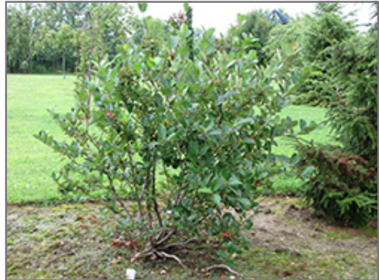
Viking Chokeberry