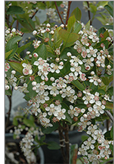
Viking Chokeberry flowers