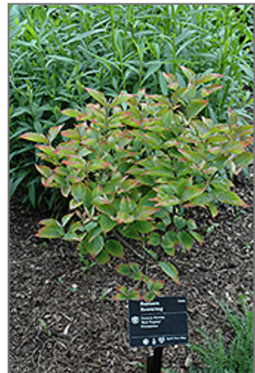
Red Pygmy Dwarf Red Flowering Dogwood