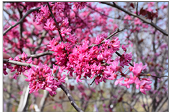
Appalachian Red Redbud flowers