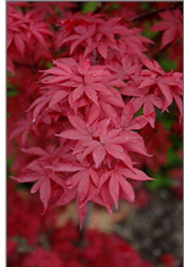
Twombly's Red Sentinel Japanese Maple foliage