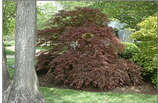
Garnet Cutleaf Japanese Maple

This shrub does best in full sun to partial shade. It prefers to grow in average to moist conditions, and shouldn't be allowed to dry out. It is particular about its soil conditions, with a strong preference for rich, neutral soils. It is somewhat tolerant of urban pollution, and will benefit from being planted in a relatively sheltered location. Consider applying a thick mulch around the root zone in winter to protect it in exposed locations or colder microclimates. This is a selected variety of a species not originally from North America.