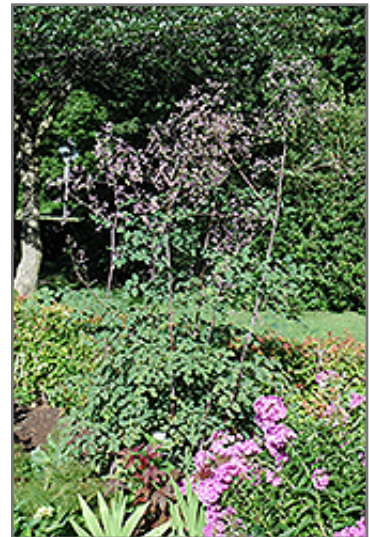
Rochebrun Meadow Rue in bloom