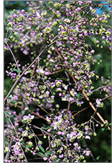
Rochebrun Meadow Rue flowers