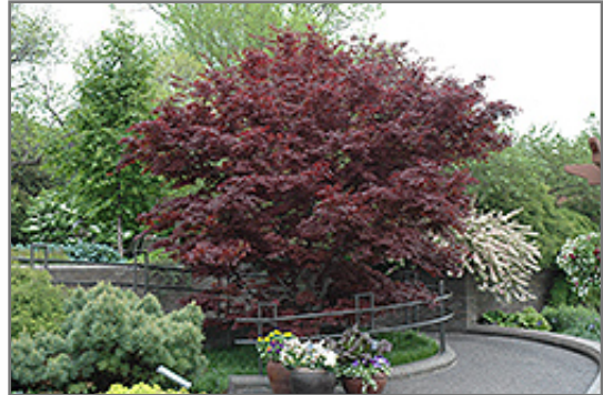
Bloodgood Japanese Maple