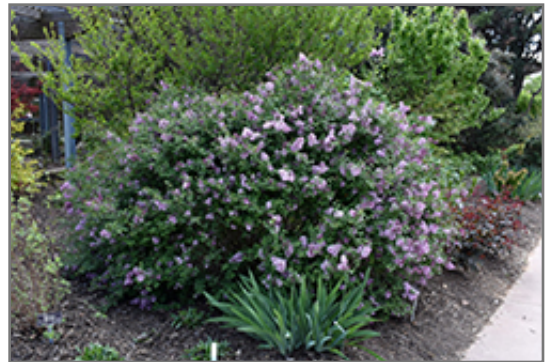
Bloomerang Purple Lilac in bloom