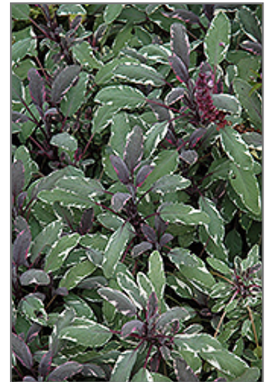
Tricolor Sage foliage