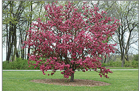
Purple Prince Flowering Crabapple in bloom