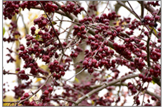
Purple Prince Flowering Crabapple fruit

This tree should only be grown in full sunlight. It prefers to grow in average to moist conditions, and shouldn't be allowed to dry out. It is not particular as to soil type or pH. It is highly tolerant of urban pollution and will even thrive in inner city environments. This particular variety is an interspecific hybrid.