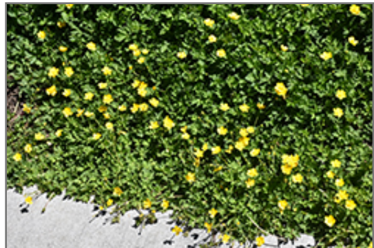
Barren Strawberry in bloom