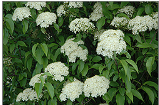
Nannyberry flowers