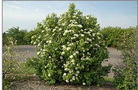
Nannyberry in bloom