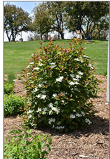
Redwing Highbush Cranberry in bloom