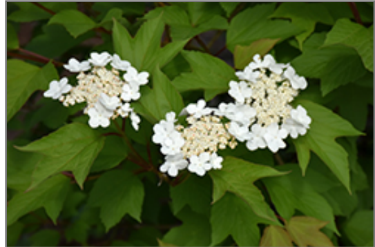
Redwing Highbush Cranberry flowers

Redwing Highbush Cranberry is a dense multi-stemmed deciduous shrub with an upright spreading habit of growth. Its average texture blends into the landscape, but can be balanced by one or two finer or coarser trees or shrubs for an effective composition.