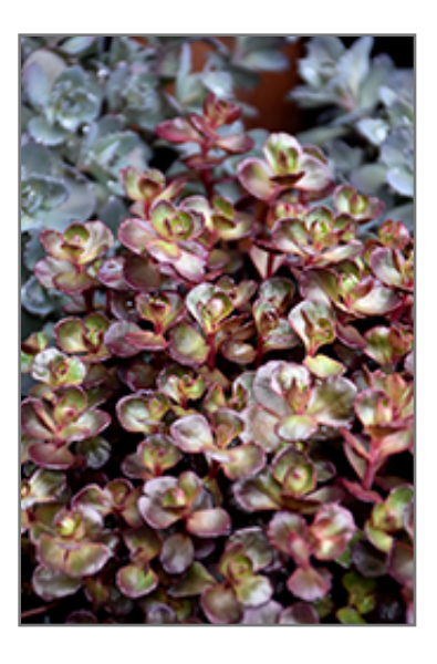
Voodoo Stonecrop foliage