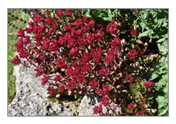
Voodoo Stonecrop in bloom