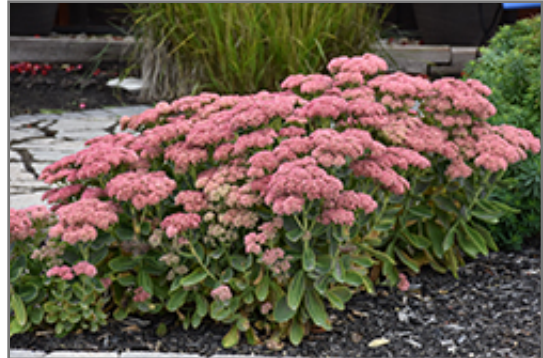
Autumn Fire Stonecrop in bloom

Autumn Fire Stonecrop is recommended for the following landscape applications;