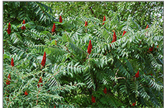
Staghorn Sumac fruit