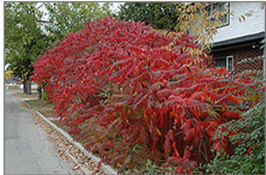
Staghorn Sumac in fall

Staghorn Sumac is recommended for the following landscape applications;