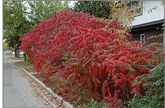
Staghorn Sumac in fall

Staghorn Sumac is recommended for the following landscape applications;