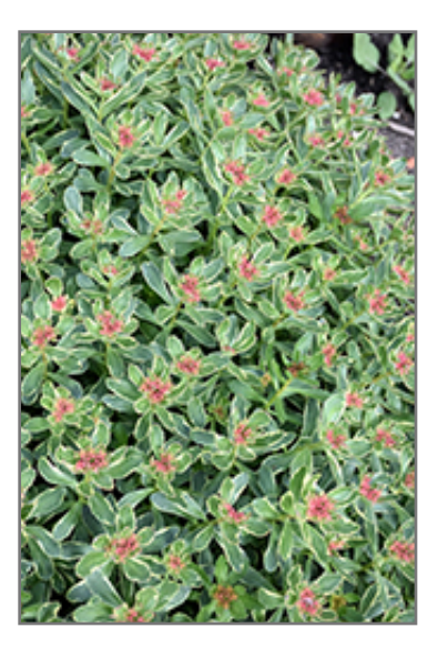
Variegated Russian Stonecrop foliage