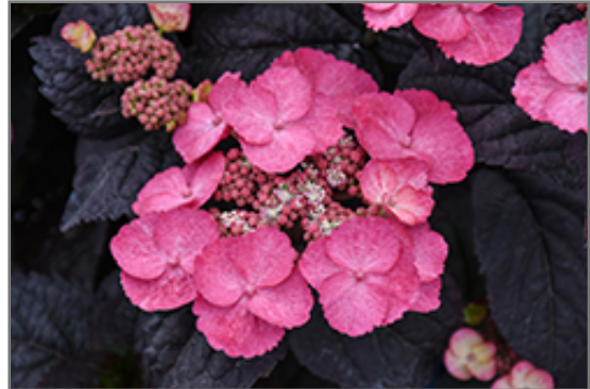
Pink Dynamo Hydrangea flowers