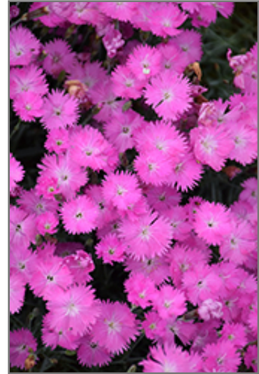
Firewitch Pinks flowers

Firewitch Pinks is recommended for the following landscape applications;