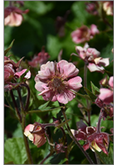
Tempo Rose Avens flowers