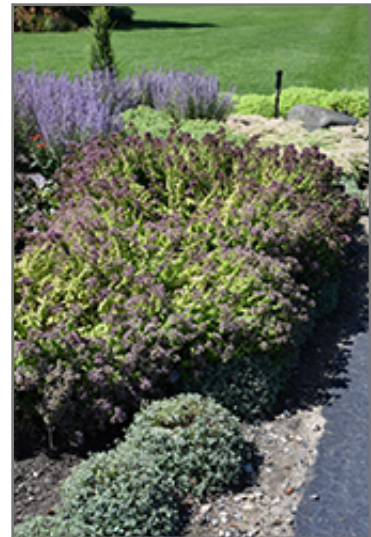
Drops of Jupiter Oregano in bloom