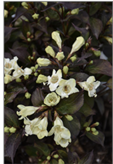
Wine & Spirits Weigela flowers