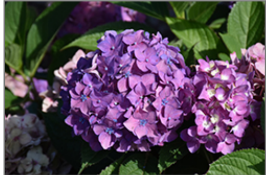
Let's Dance Arriba! Hydrangea flowers

Let's Dance Arriba! Hydrangea is recommended for the following landscape applications;