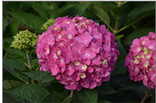
Let's Dance Arriba! Hydrangea flowers