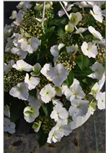
Fairytrail Bride Cascade Hydrangea flowers