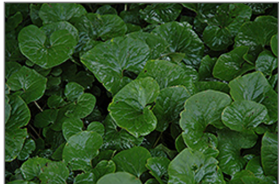
Canadian Wild Ginger