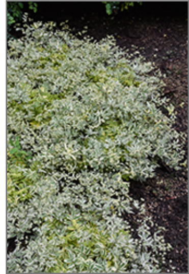
Golden Feathers Jacob's Ladder foliage