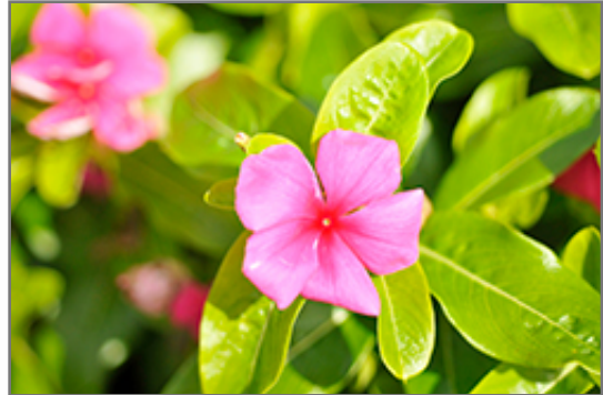
Pacifica XP Punch Vinca flowers

Pacifica XP Punch Vinca is recommended for the following landscape applications;