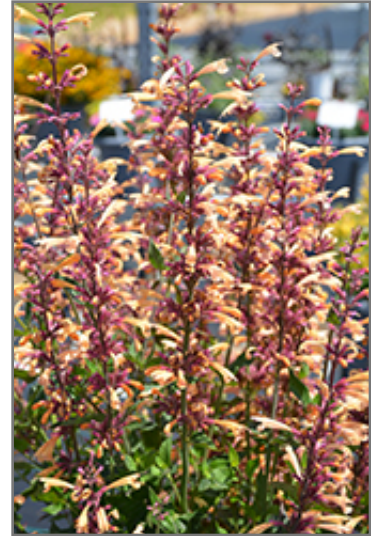
Meant To Bee Queen Nectarine Anise Hyssop flowers

Meant To Bee Queen Nectarine Anise Hyssop is recommended for the following landscape applications;