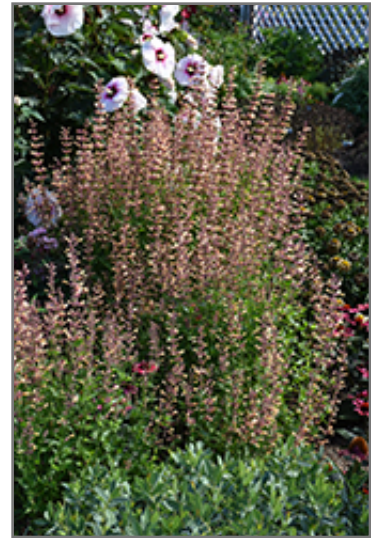
Meant To Bee Queen Nectarine Anise Hyssop in bloom

Meant To Bee Queen Nectarine Anise Hyssop is a fine choice for the garden, but it is also a good selection for planting in outdoor pots and containers. With its upright habit of growth, it is best suited for use as a 'thriller' in the 'spiller-thriller-filler' container combination; plant it near the center of the pot, surrounded by smaller plants and those that spill over the edges. It is even sizeable enough that it can be grown alone in a suitable container. Note that when growing plants in outdoor containers and baskets, they may require more frequent waterings than they would in the yard or garden.