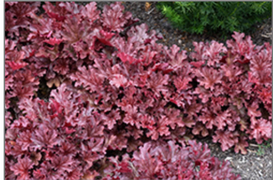
Ruby Tuesday Coral Bells

Ruby Tuesday Coral Bells is recommended for the following landscape applications;