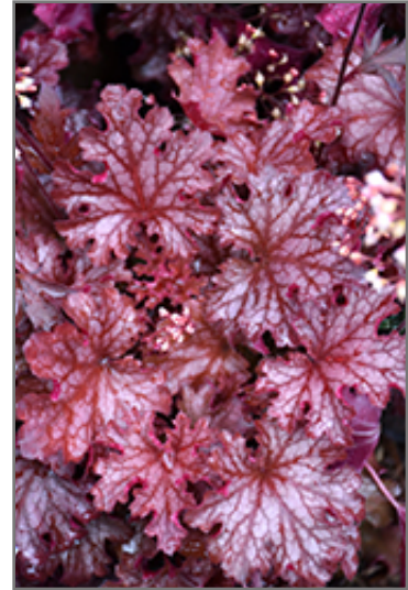
Ruby Tuesday Coral Bells foliage

Ruby Tuesday Coral Bells will grow to be about 9 inches tall at maturity extending to 16 inches tall with the flowers, with a spread of 14 inches. When grown in masses or used as a bedding plant, individual plants should be spaced approximately 12 inches apart. Its foliage tends to remain low and dense right to the ground. It grows at a medium rate, and under ideal conditions can be expected to live for approximately 10 years. As an evergreen perennial, this plant will typically keep its form and foliage year-round.