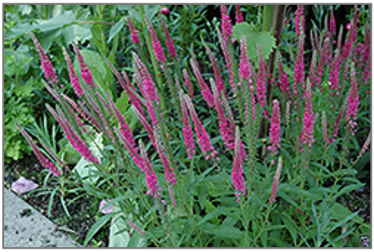
Red Fox Speedwell flowers

Red Fox Speedwell is recommended for the following landscape applications;