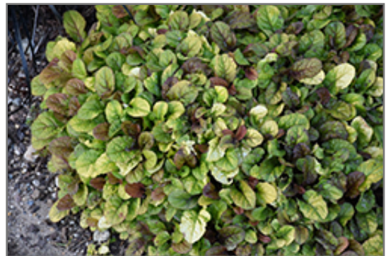
Feathered Friends Parrot Paradise Bugleweed