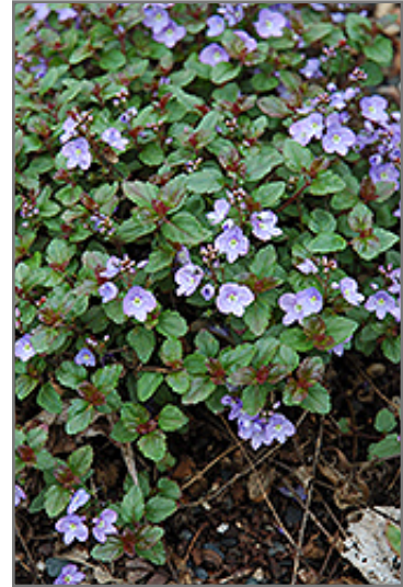
Waterperry Blue Speedwell in bloom