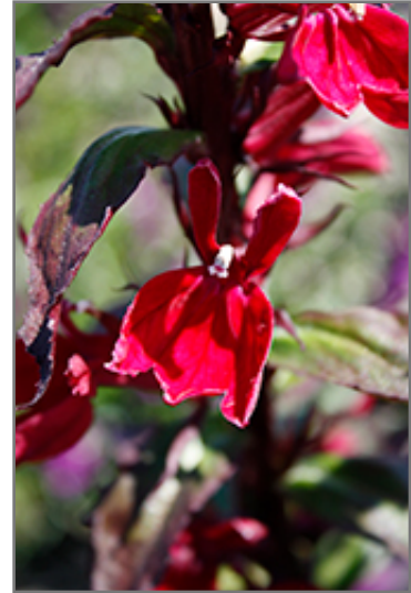
Starship Burgundy Lobelia flowers