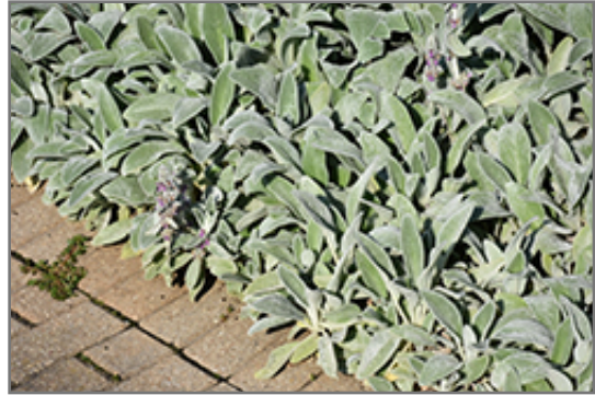
Lamb's Ears

Lamb's Ears will grow to be about 12 inches tall at maturity extending to 24 inches tall with the flowers, with a spread of 18 inches. When grown in masses or used as a bedding plant, individual plants should be spaced approximately 15 inches apart. Its foliage tends to remain dense right to the ground, not requiring facer plants in front. It grows at a fast rate, and under ideal conditions can be expected to live for approximately 10 years. As an herbaceous perennial, this plant will usually die back to the crown each winter, and will regrow from the base each spring. Be careful not to disturb the crown in late winter when it may not be readily seen!