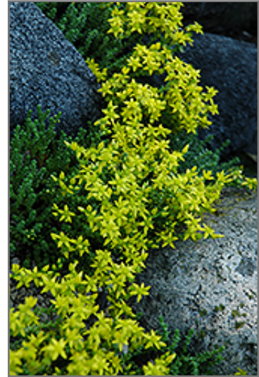
Six Row Stonecrop flowers