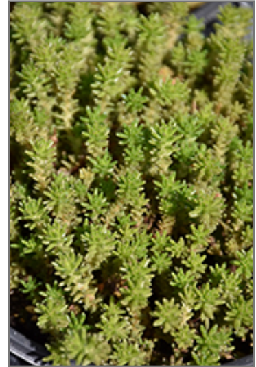
Six Row Stonecrop foliage

Six Row Stonecrop is a fine choice for the garden, but it is also a good selection for planting in outdoor pots and containers. Because of its spreading habit of growth, it is ideally suited for use as a 'spiller' in the 'spiller-thriller-filler' container combination; plant it near the edges where it can spill gracefully over the pot. Note that when growing plants in outdoor containers and baskets, they may require more frequent waterings than they would in the yard or garden.