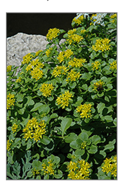
Russian Stonecrop flowers