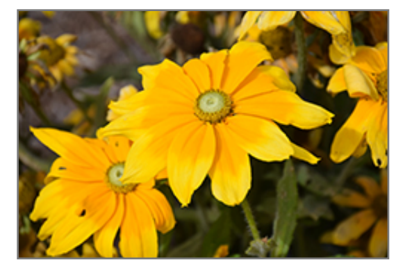
Prairie Sun Coneflower flowers

Prairie Sun Coneflower is recommended for the following landscape applications;