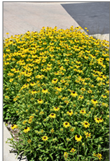
Viette's Little Suzy Coneflower in bloom