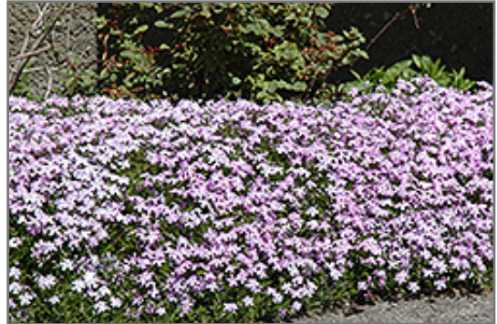
Emerald Blue Moss Phlox in bloom

This plant does best in full sun to partial shade. It prefers dry to average moisture levels with very well-drained soil, and will often die in standing water. It is considered to be drought-tolerant, and thus makes an ideal choice for a low-water garden or xeriscape application. It is not particular as to soil type, but has a definite preference for alkaline soils. It is highly tolerant of urban pollution and will even thrive in inner city environments. Consider covering it with a thick layer of mulch in winter to protect it in exposed locations or colder microclimates. This is a selection of a native North American species. It can be propagated by division; however, as a cultivated variety, be aware that it may be subject to certain restrictions or prohibitions on propagation.