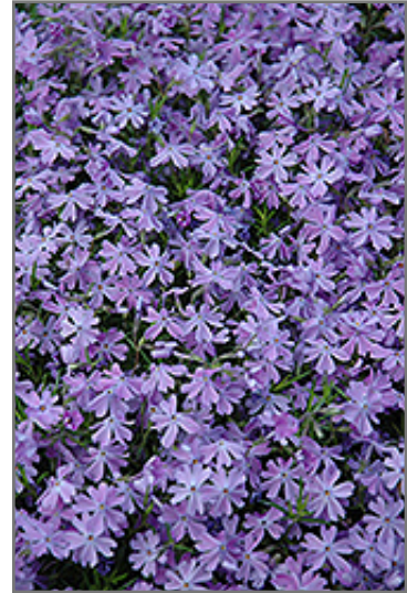
Emerald Blue Moss Phlox flowers