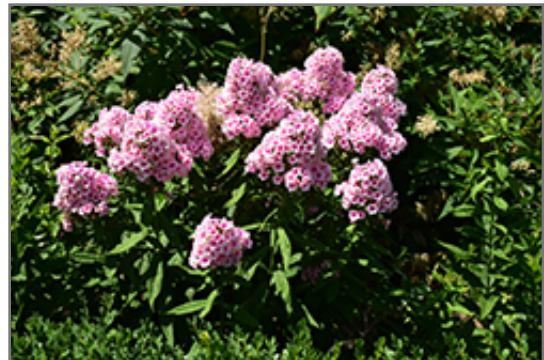
Bright Eyes Garden Phlox in bloom