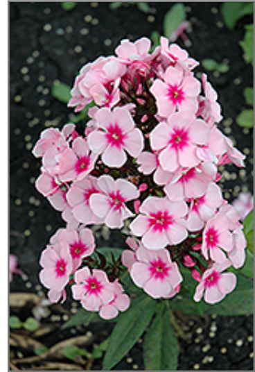
Bright Eyes Garden Phlox flowers

Bright Eyes Garden Phlox is a fine choice for the garden, but it is also a good selection for planting in outdoor pots and containers. With its upright habit of growth, it is best suited for use as a 'thriller' in the 'spiller-thriller-filler' container combination; plant it near the center of the pot, surrounded by smaller plants and those that spill over the edges. It is even sizeable enough that it can be grown alone in a suitable container. Note that when growing plants in outdoor containers and baskets, they may require more frequent waterings than they would in the yard or garden.