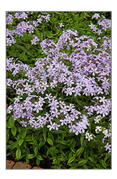
Woodland Phlox flowers

Woodland Phlox will grow to be about 8 inches tall at maturity, with a spread of 18 inches. When grown in masses or used as a bedding plant, individual plants should be spaced approximately 16 inches apart. Its foliage tends to remain low and dense right to the ground. It grows at a medium rate, and under ideal conditions can be expected to live for approximately 10 years. As an herbaceous perennial, this plant will usually die back to the crown each winter, and will regrow from the base each spring. Be careful not to disturb the crown in late winter when it may not be readily seen!