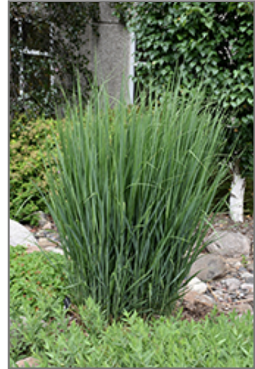
Northwind Switch Grass

Northwind Switch Grass will grow to be about 4 feet tall at maturity, with a spread of 3 feet. It tends to be leggy, with a typical clearance of 1 foot from the ground, and should be underplanted with lower-growing perennials. It grows at a medium rate, and under ideal conditions can be expected to live for approximately 15 years. As an herbaceous perennial, this plant will usually die back to the crown each winter, and will regrow from the base each spring. Be careful not to disturb the crown in late winter when it may not be readily seen!