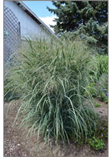
Northwind Switch Grass in bloom

This plant does best in full sun to partial shade. It is very adaptable to both dry and moist locations, and should do just fine under typical garden conditions. It is considered to be drought-tolerant, and thus makes an ideal choice for a low-water garden or xeriscape application. It is not particular as to soil type, but has a definite preference for alkaline soils, and is able to handle environmental salt. It is somewhat tolerant of urban pollution. This is a selection of a native North American species. It can be propagated by division; however, as a cultivated variety, be aware that it may be subject to certain restrictions or prohibitions on propagation.