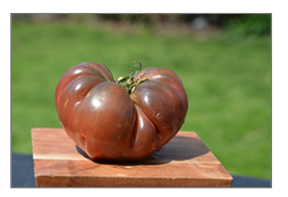
Heirloom Marriage Cherokee Carbon Tomato fruit

Heirloom Marriage Cherokee Carbon Tomato will grow to be about 6 feet tall at maturity, with a spread of 3 feet. When planted in rows, individual plants should be spaced approximately 3 feet apart. Because of its vigorous growth habit, it may require staking or supplemental support. This fast-growing vegetable plant is an annual, which means that it will grow for one season in your garden and then die after producing a crop.