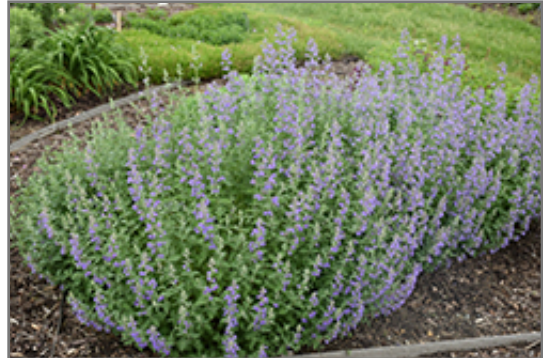
Walker's Low Catmint in bloom